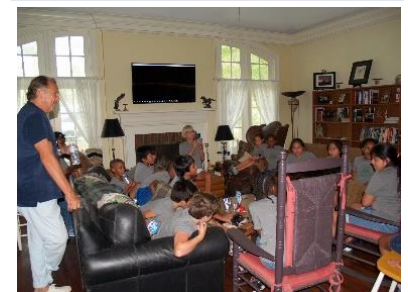
Camp Rockhurst seminar