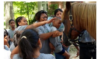
Students excited to meet Patriot.