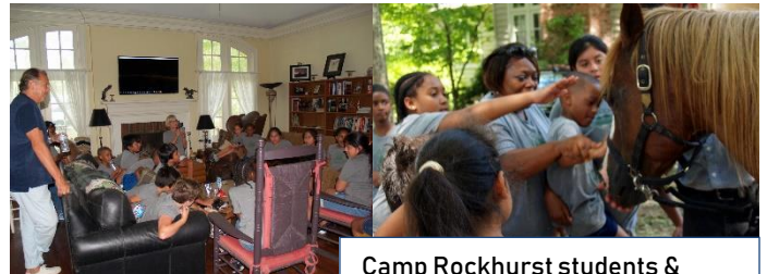
Camp Rockhurst students & mentors are as excited to see Patriot as we are to host them.