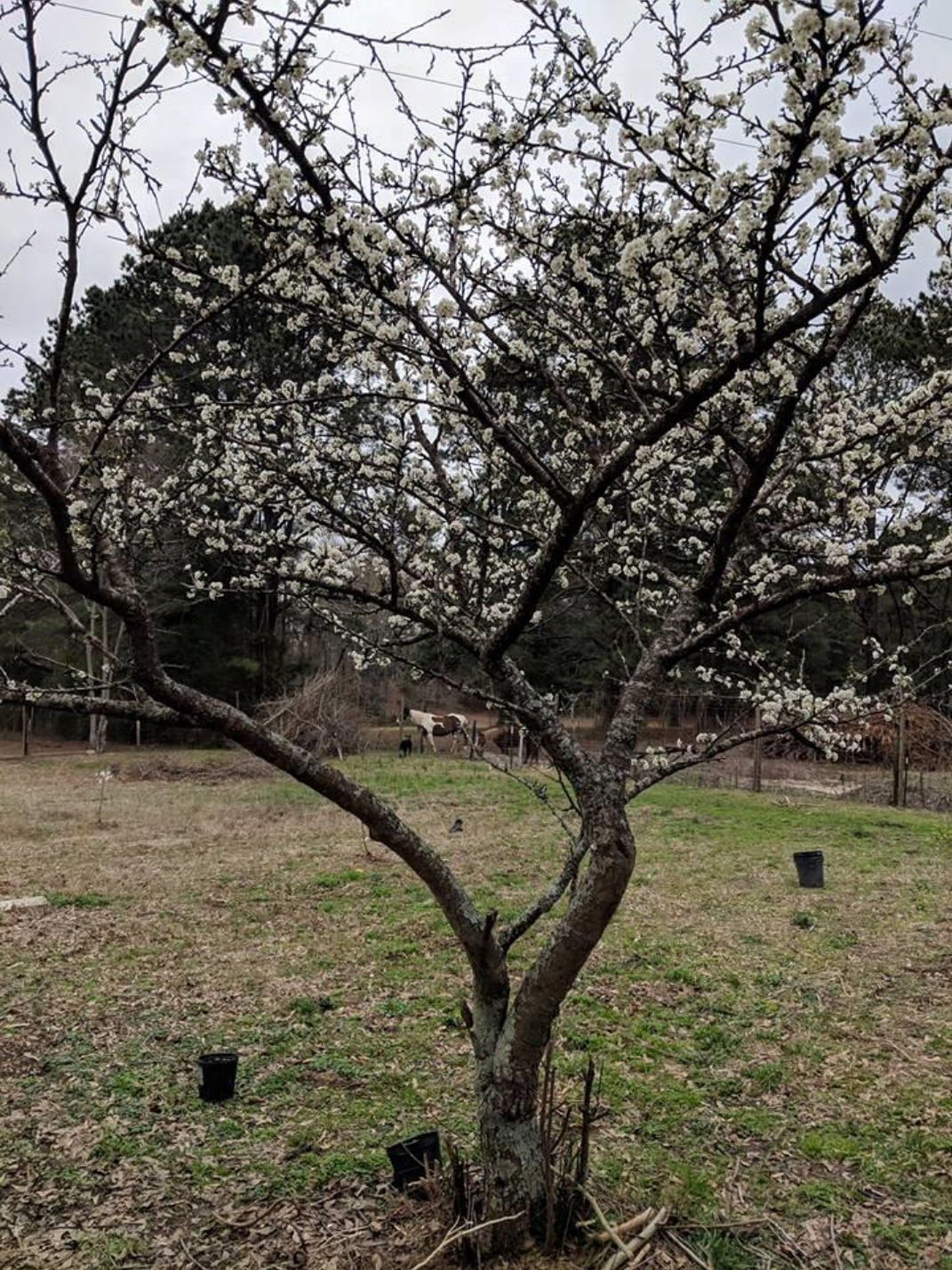
Plum Blooms, fruit Summer